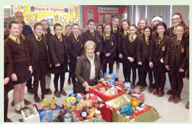
Loreto College, Omagh, presented 44 hampers to SVP Conferences in Omagh, Beragh and Killyclogher.