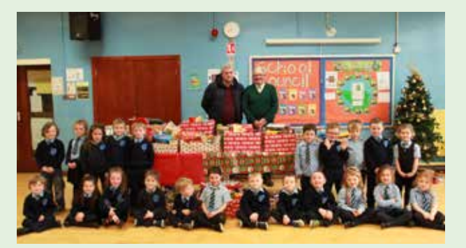
Infants of St Joseph's Primary School in Ederney donating Christmas food hampers to members of Ederney SVP.