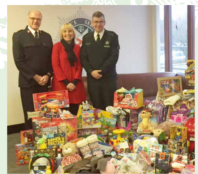
Some of the donations from the PSNI.