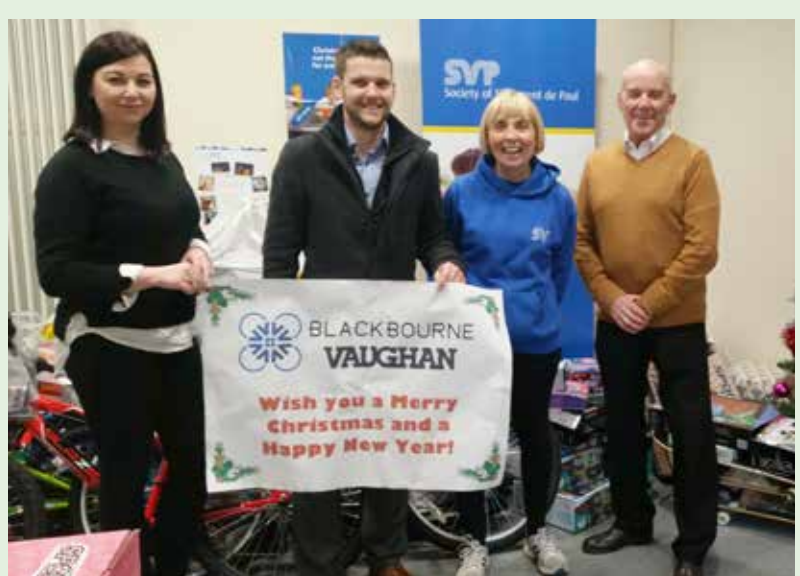
Vaughan Engineering supported us once again.