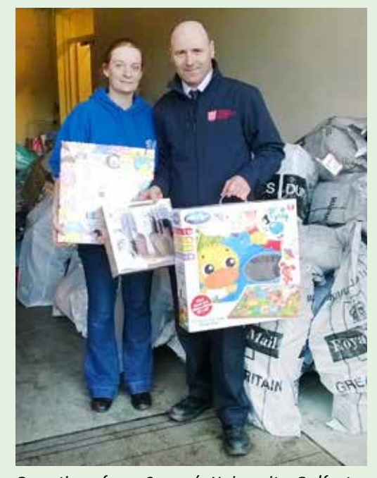
Donations from Queen's University, Belfast.