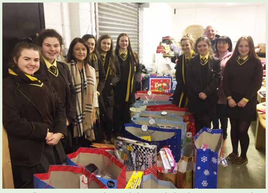
Loreto College year 13 SVP Conference helping with the Christmas Toy Appeal.