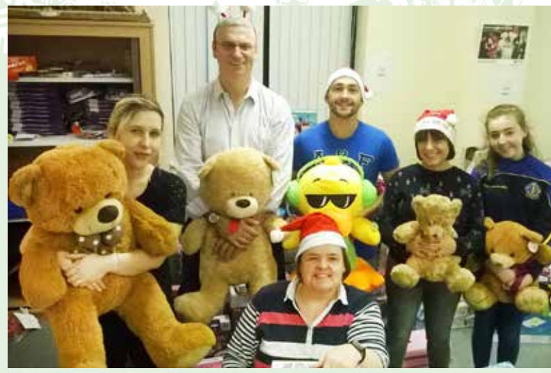
Volunteers from the Health and Social Care Board.