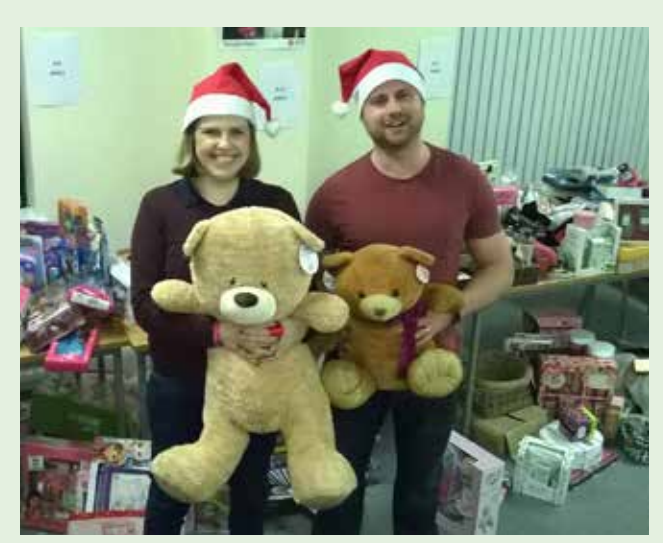
Happy volunteers from the Public Health Agency packing toys in Regional Office.